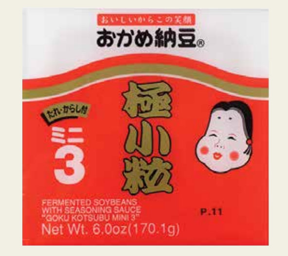
Okame Natto Goku Kotsubu

Fermented soybeans with seasoning sauce. Frozen. 3 pk.